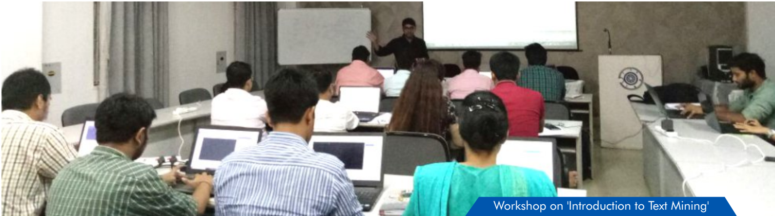
Workshop on 'Introduction to Text Mining'